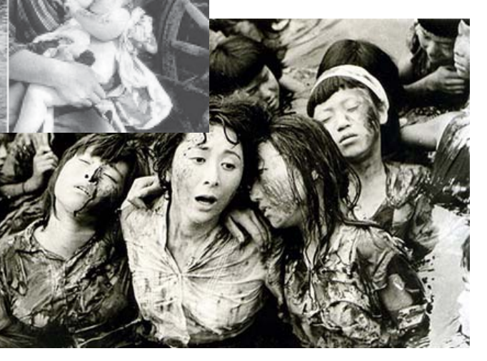
the human and physical toll of the devastation wrought on Hiroshima & Nagasaki

the coming federal election campaign by demanding Canada sign and ratify the Treaty on the Prohibition of Nuclear Weapons (TPNW). And we should call on every