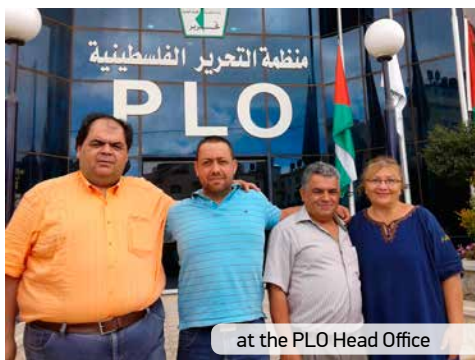
at the PLO Head Office