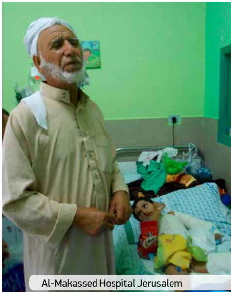
Al-Makassed Hospital Jerusalem