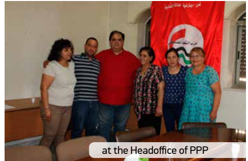
at the Headoffice of PPP

The President of the Turkish Peace Association, Zuhal Okuyan , expressed the view that the overwhelming majority of the people of Turkey stand at the side of the Palestinian people, in contrast to Prime Minister Erdogan and his government, who try to play with people's feelings, while in reality supporting Israel and playing a leading role with the USA, the EU, Qatar and Saudi Arabia in war crimes committed in Syria.