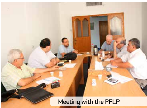
Meeting with the PFLP