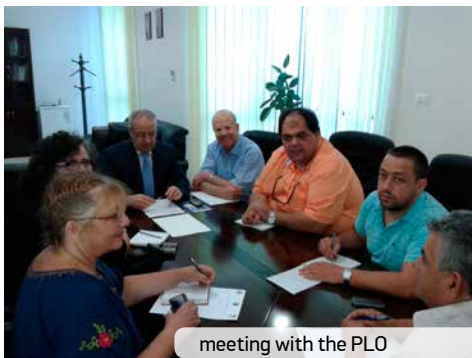
meeting with the PLO

In connection with the objectives of the negotiations between the Palestinians and Israel in Cairo, Taisir Khaled set out the Palestinians’ basic demands for a truce to be agreed upon, such as the immediate lifting of the siege with the checkpoints being opened, the right to use the port and airport, the right of farmers to access and farm the 24% of their land which they have been prohibited from doing by Israel for reasons of security and the right to fish up to 12 miles from the shores of Gaza.