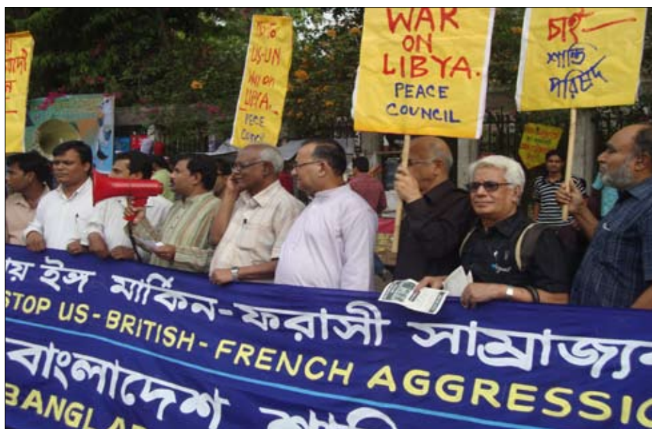
Bangladesh Peace Council demonstration against US-NATO aggression in Libya

13. The conference expresses its solidarity with the people of Nepal and hope that it will carry forward the peace